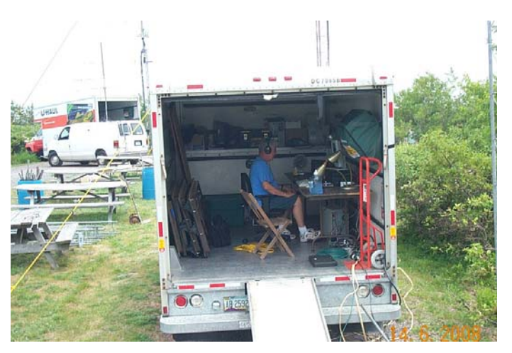
Getting another grid on 6 Meters