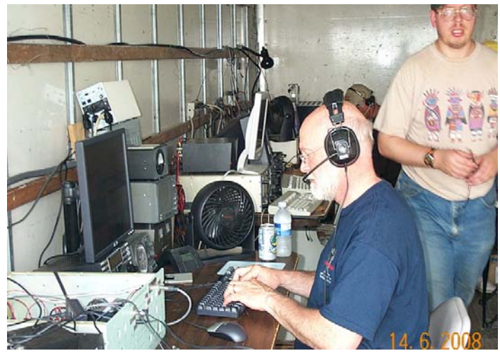
Running the bands in the 2M + 222 + 432 truck