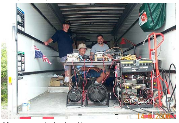
Microwave truck - hard working ops