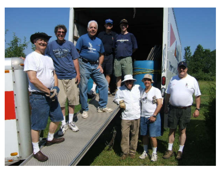
W3GXB's barn. The loadout team