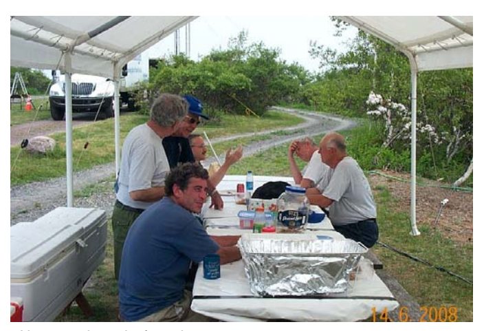
About an hour before the contest start