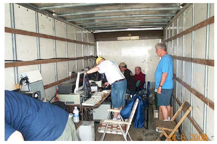
2 M + 222 + 432 truck. Fixing a blown fuse in the 222 xvtr