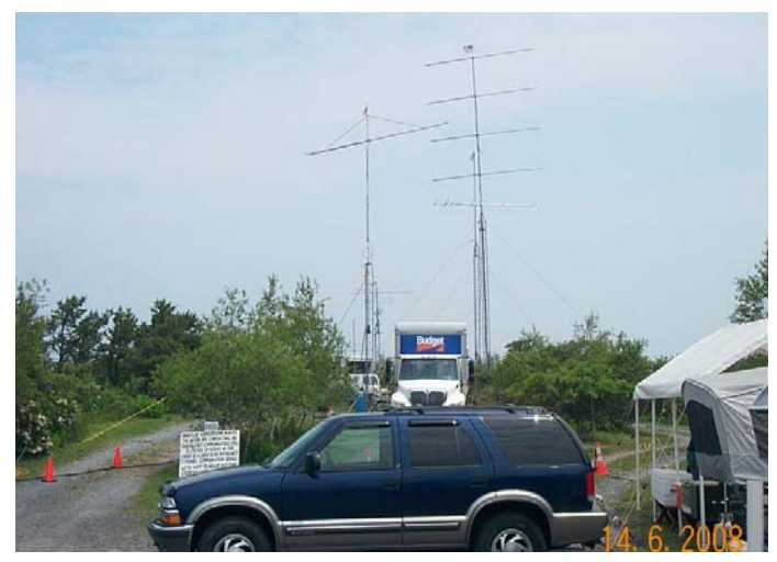
Rigs straight ahead, food on right